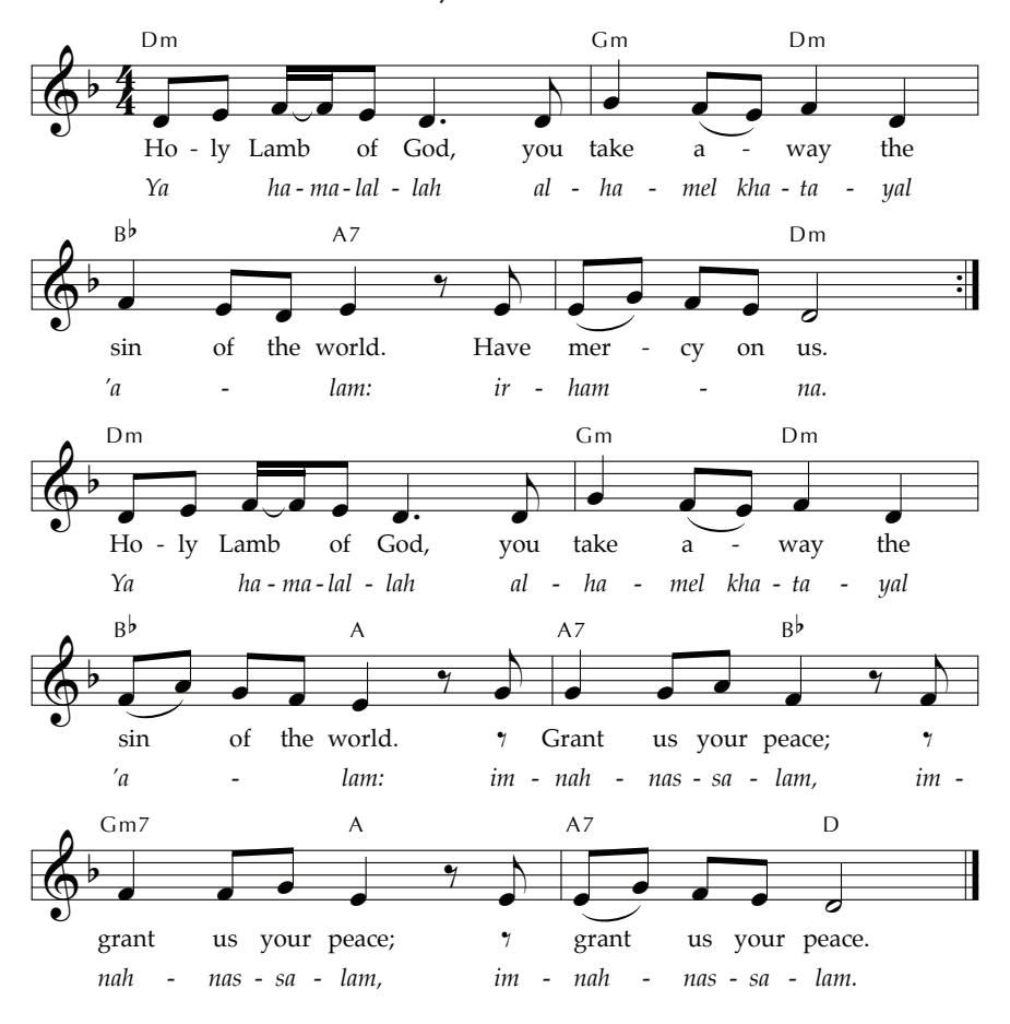
Music © 2003 Yusuf Khill, reprinted for convenience from Glory to God © 2013 Westminster John Knox Press