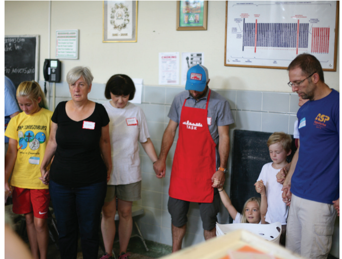
The group prays before serving at Loaves and Fishes last August. Every year volunteers go to Trenton to serve a warm meal to hundreds of people and demonstrate God's love.

Grab this summer opportunity to reflect on our role as Christians in a world of uncertainty, change, and anxiety. Come looking to claim your hope, Christian resilience, and the gifts God bestows for the work our times call us to do.