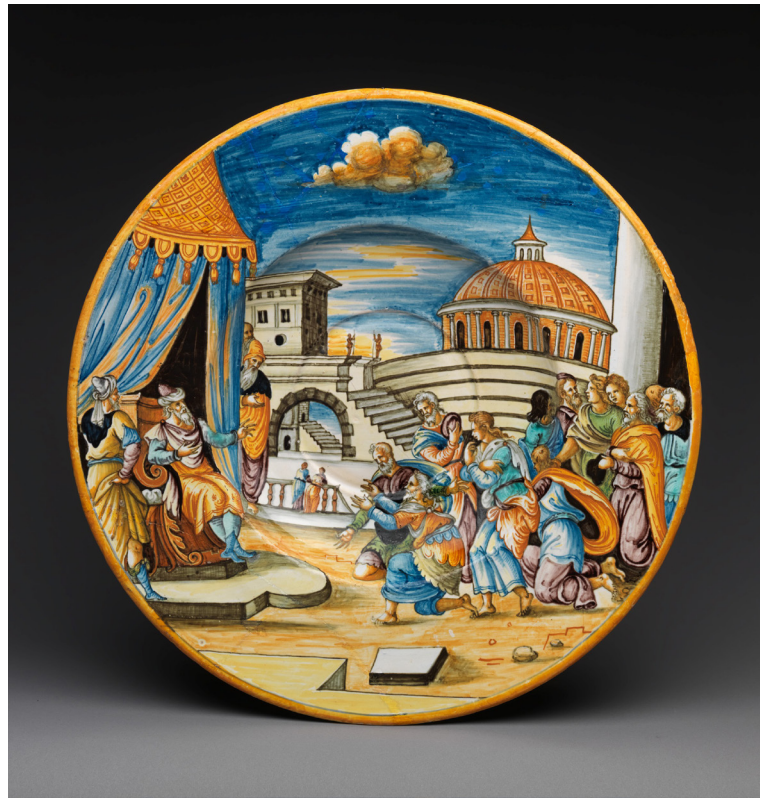
Dish with Joseph and His Brothers , Metropolitan Museum of Art. This dish, composed of Faïence (tin-glazed earthenware), dates ca. 1630-45 and measures 2 1/8 × 17 1/8 in.

Let's explore family dynamics in Genesis in an intergenerational, interactive class of middle school, high school, and adults of all ages. Grab this opportunity to have more than "Hi, how are you?" conversations between Nassau youth and adults while you enjoy a continental breakfast.