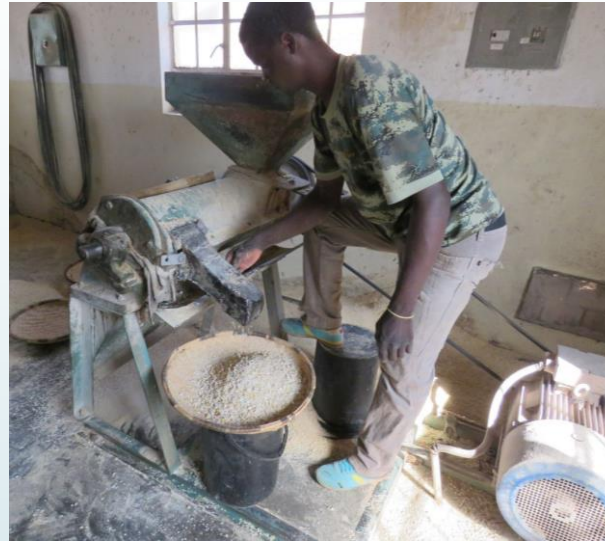
Maize Mill Complex