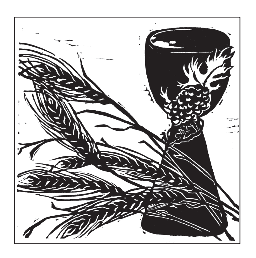
Nassau Presbyterian Church