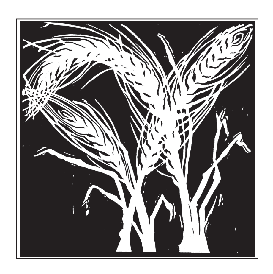
Nassau Presbyterian Church