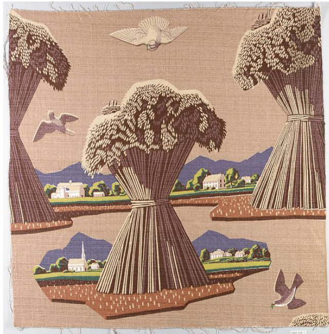
Harvest Time, Rockwell Kent (American, Tarrytown, New York 1882–1971), 1950, Printed Cotton, 21 3/4 × 21 1/2 in., Metropolitan Museum of Art, NY, NY, www.metmuseum.org

Sundays, 9:30 a.m., in the Assembly Room unless otherwise noted