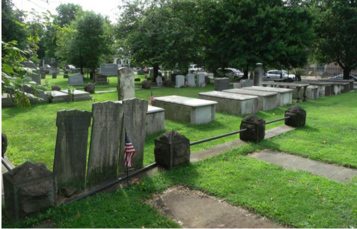
Princeton University's Presidents Plot

JOHN WITHERSPOON (1723-1794) was the sixth President of PU* (1768-1794). He served two terms in the New Jersey State Legislature. He was the only clergyman and college president to sign the Declaration of Independence. He contributed greatly to the organization of a newly independent and national Presbyterian Church and in 1789 opened its first General Assembly with a sermon and presided until the election of the first moderator. F-2