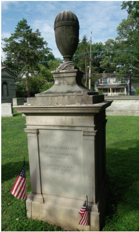
U.S. President Grover Cleveland's grave residents are buried.

First Presbyterian Church (the predecessor of Nassau Presbyterian Church) was established in 1762 and completed in 1764 with a grant of land as well as substantial financial assistance from the College. The