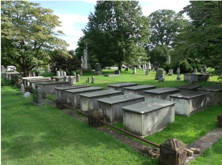
Princeton Theological Seminary Plot

writers, as well as those who have called the Princeton area home. Take your time and enjoy the rich history of America captured here, and a small town's place in that history.