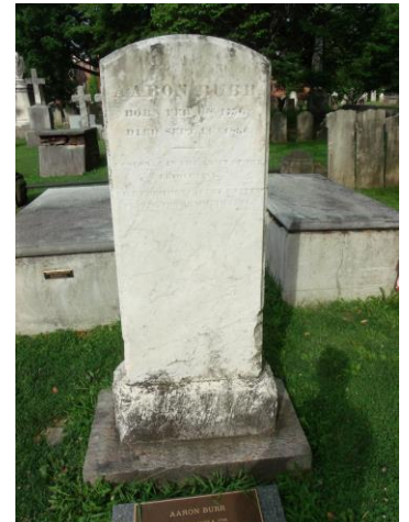
U.S. Vice President Aaron Burr, Jr.'s grave

The development of the cemetery is deeply rooted in the church, the University, and the larger local community originally settled as Stony Brook in 1681, renamed Princeton in 1724, and incorporated by the state in 1813. The oldest part, formerly known as the Old Graveyard, lies at the intersection of Wiggins and Witherspoon streets. Here one can see some of the earliest European family names in the