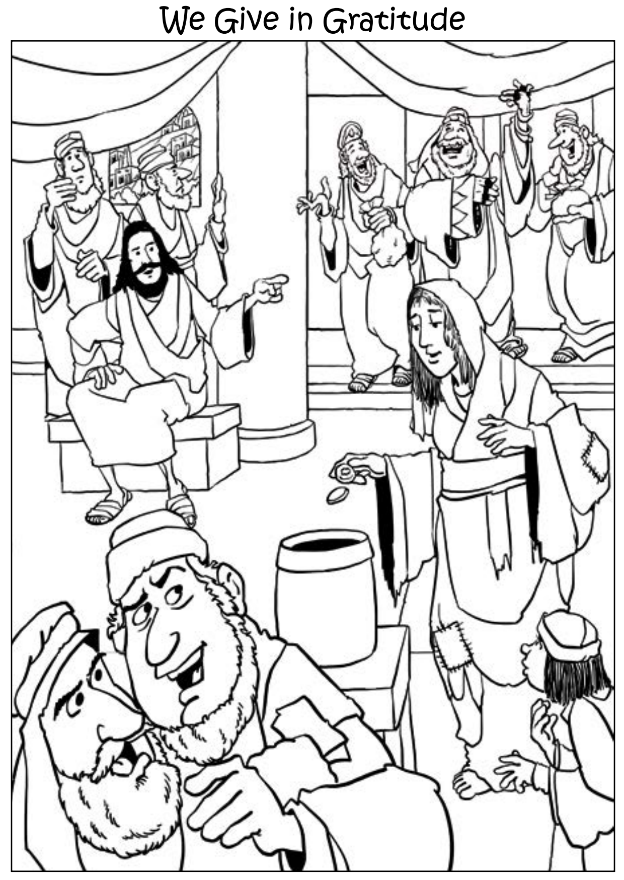
A poor widow gives her all to God.