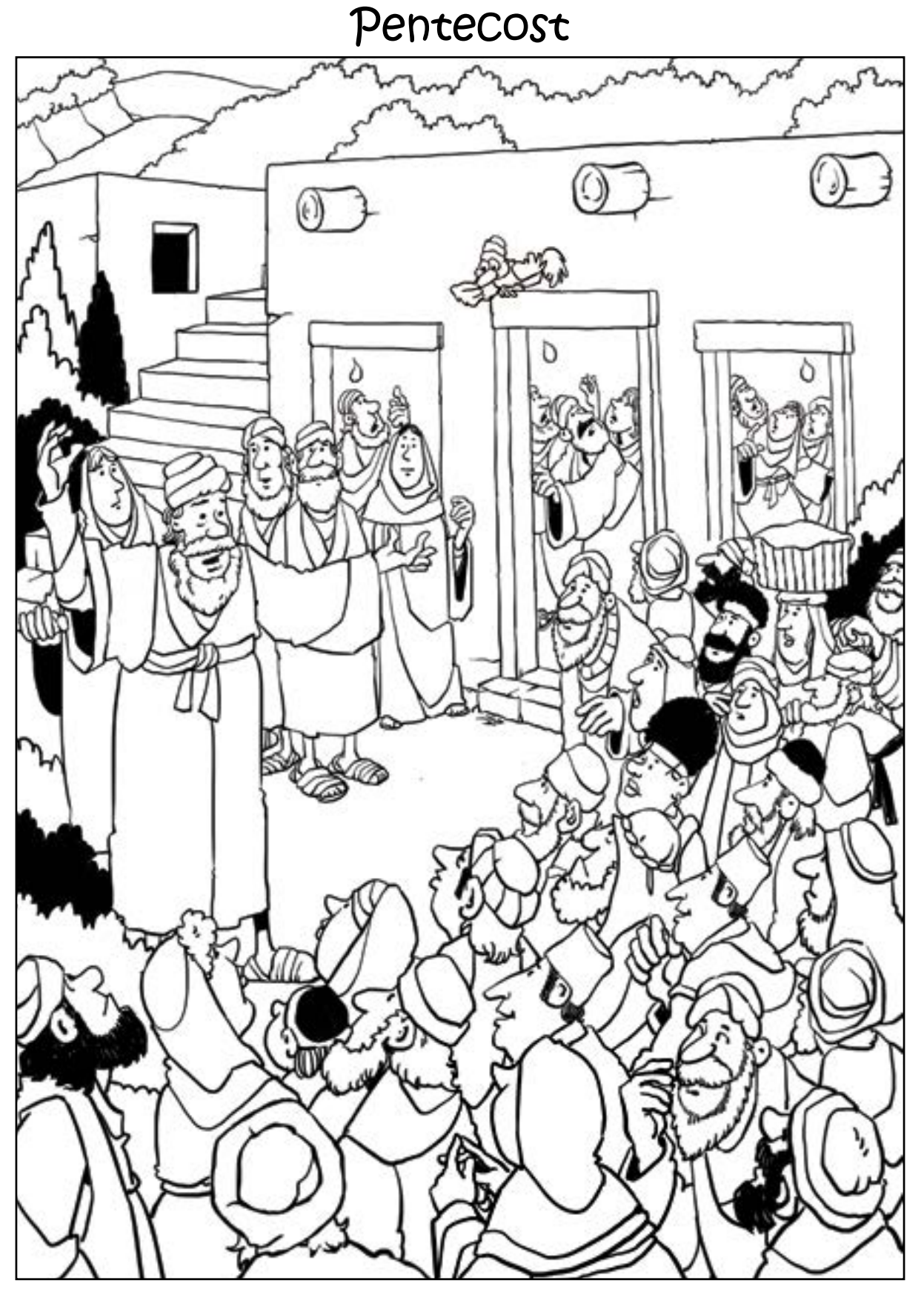
God's love is for everyone.