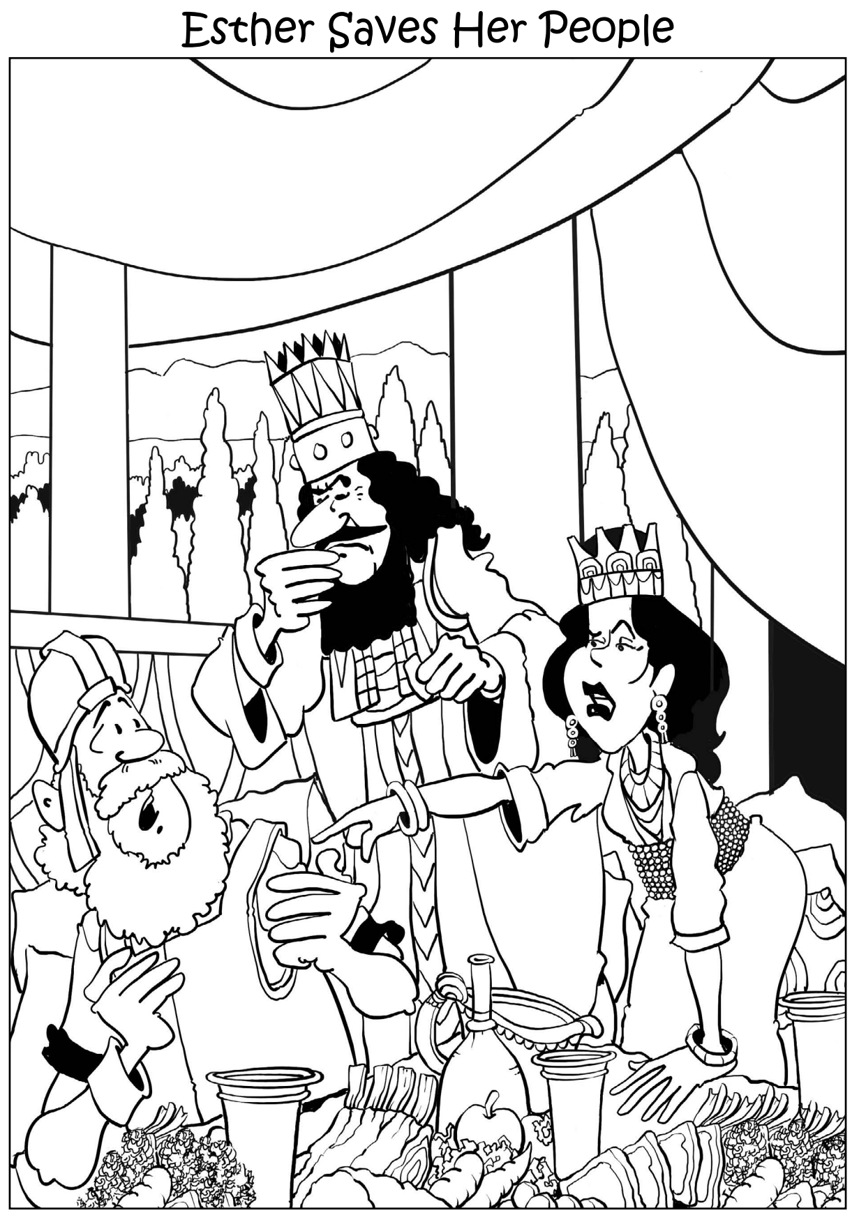
Queen Esther acted on her faith and saved her people.