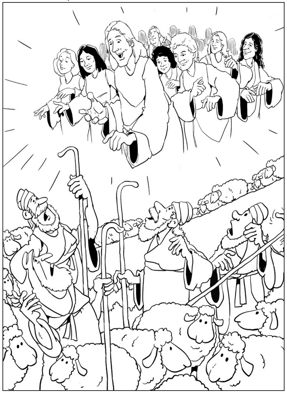
Shepherds hear the good news from messengers and run to Bethlehem.