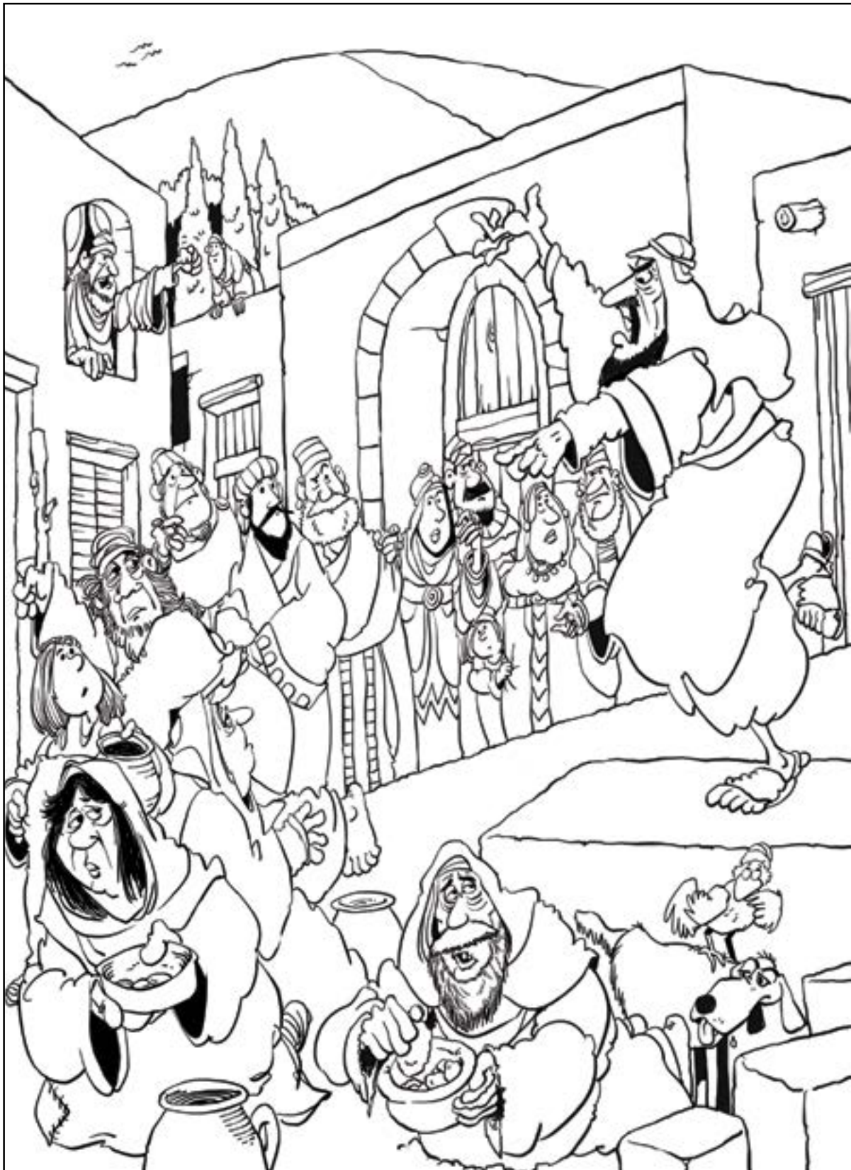
Amos tells the people with food to share their food with others.