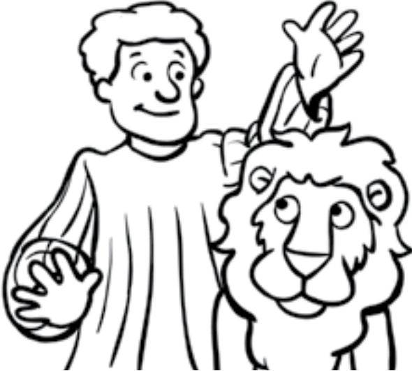
An angel shut the lions' mouths.