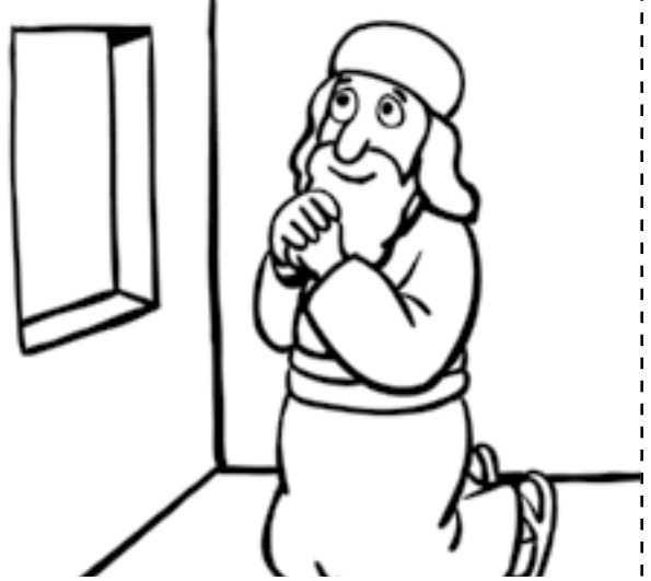
Daniel prayed to God every day.