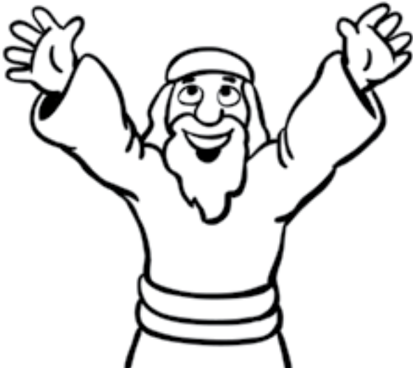
Daniel praised God.