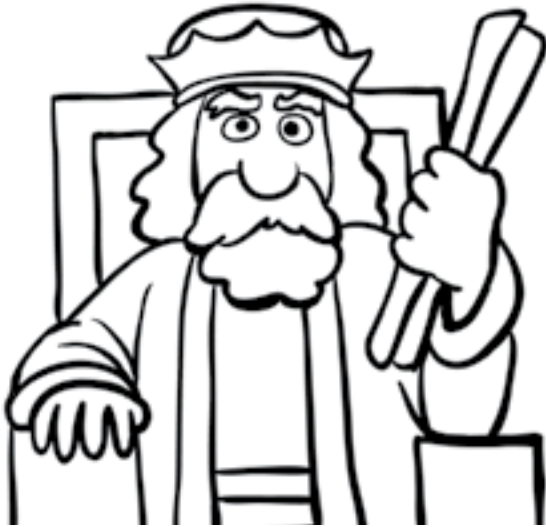
The king made a law that praying to God was not allowed.