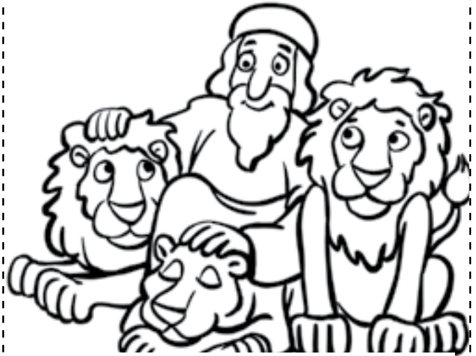
God was with Daniel in the lions' den.