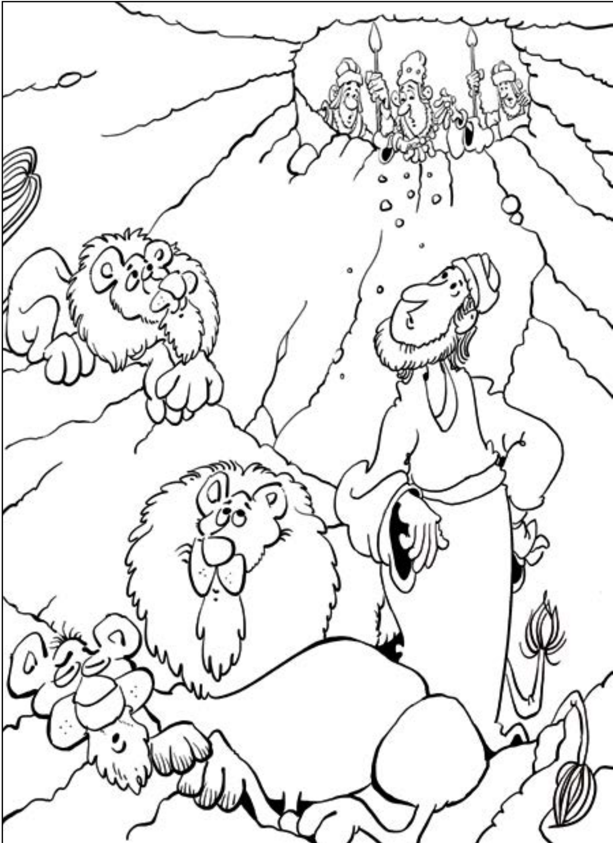
Daniel prayed to God. God took care of Daniel.