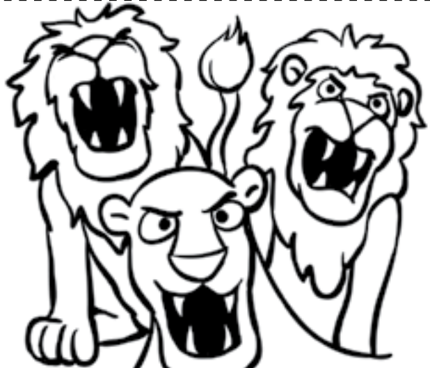
Daniel was thrown into the lions' den.