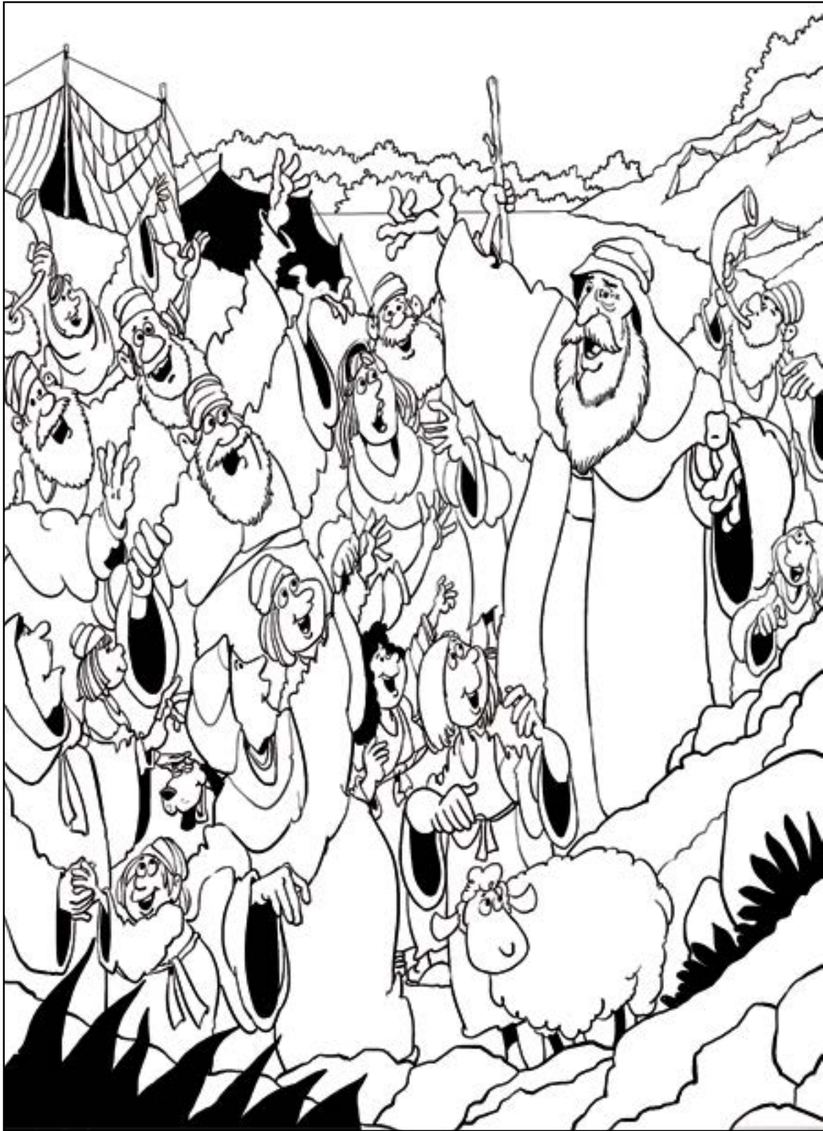
God's people celebrate a time to rest.