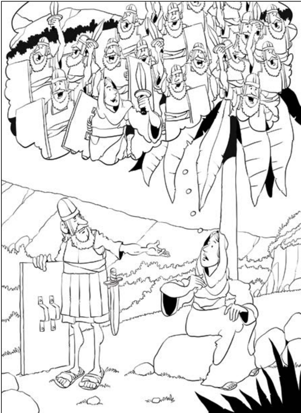
Deborah gives Barak a message from God.