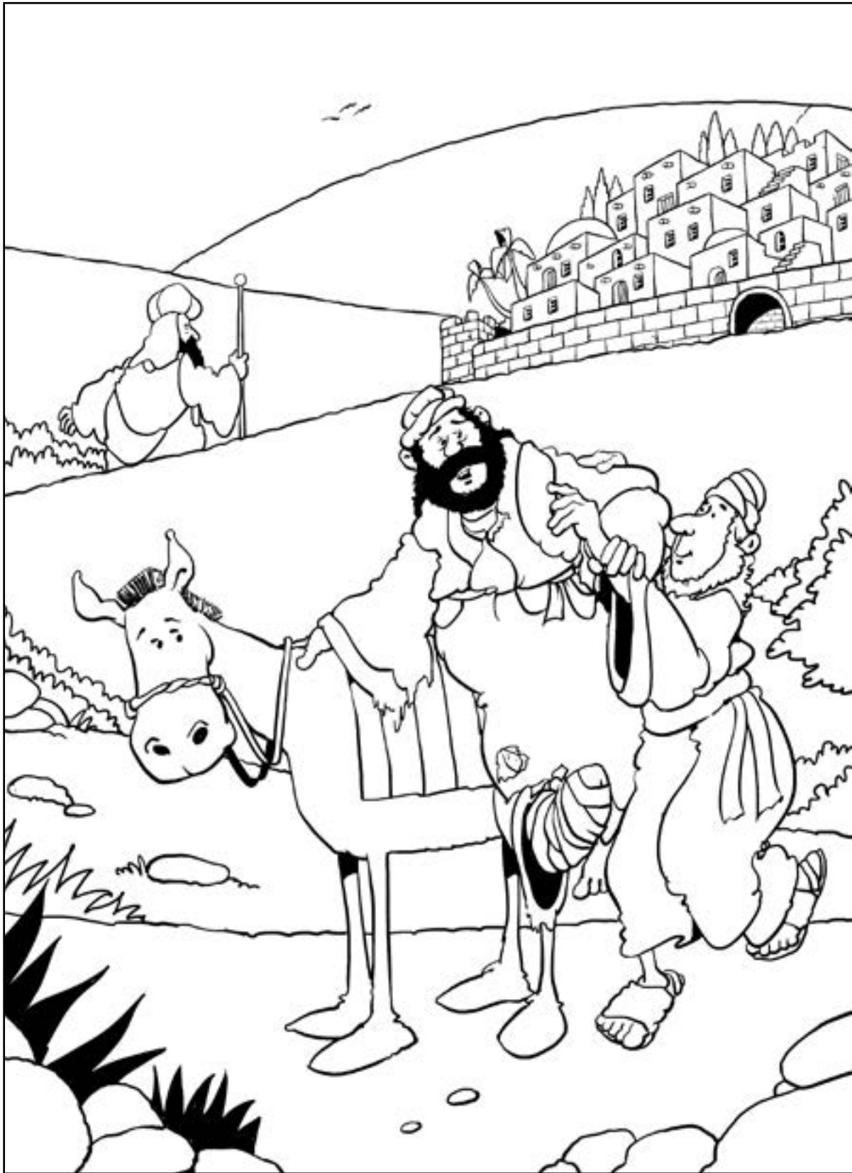
The Samaritan was a good neighbor.