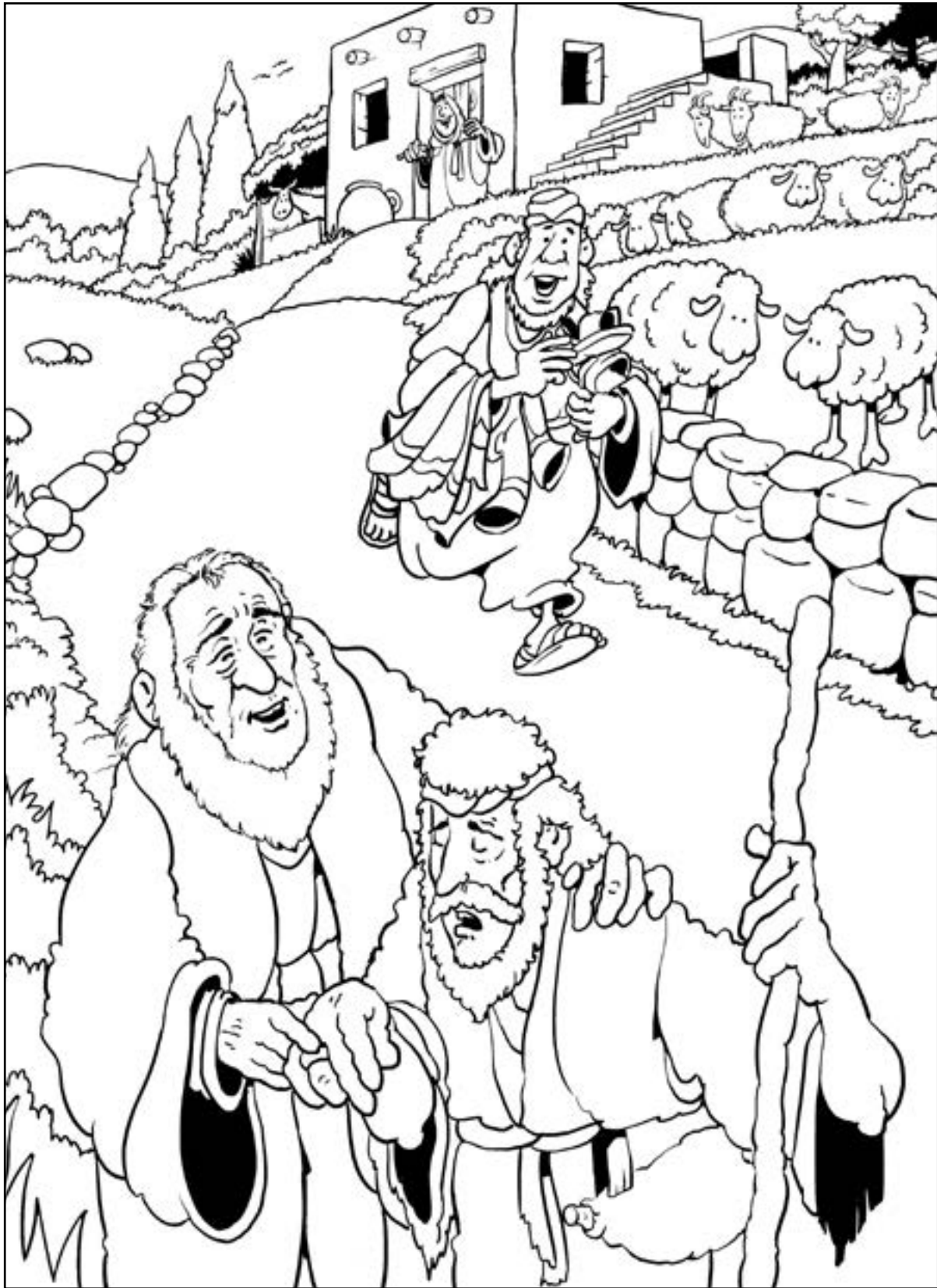
The father welcomes his son home.