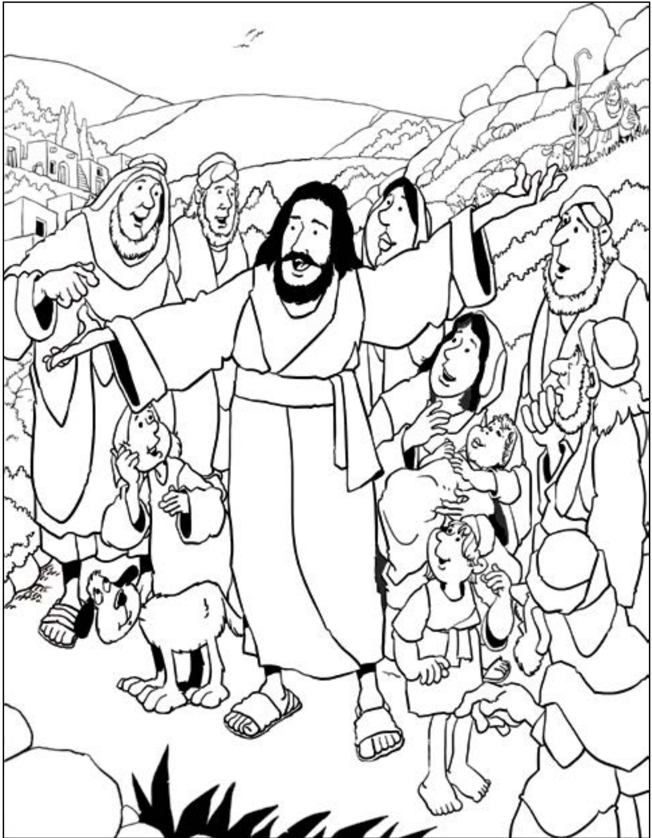
Jesus invites people to love, give, and forgive.