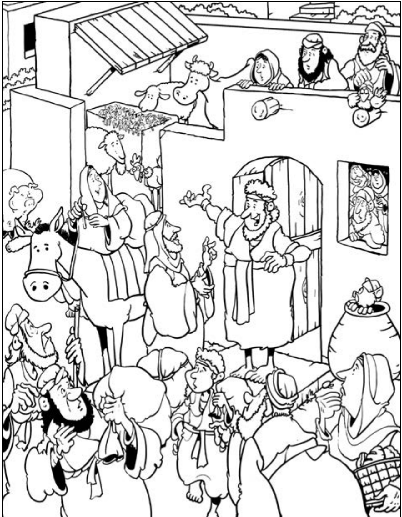
Mary and Joseph find a place to stay.