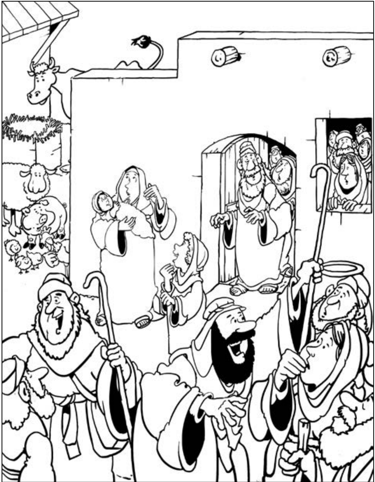
The shepherds share the good news of Jesus' birth.