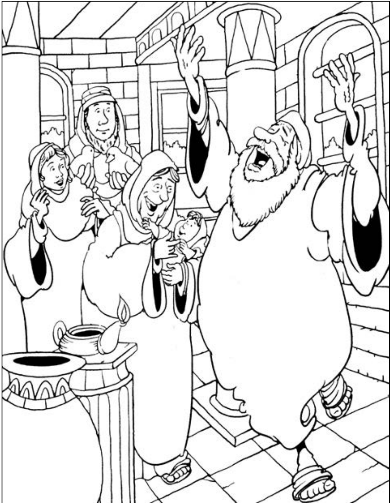
Simeon and Anna give praise to God when they meet baby Jesus.