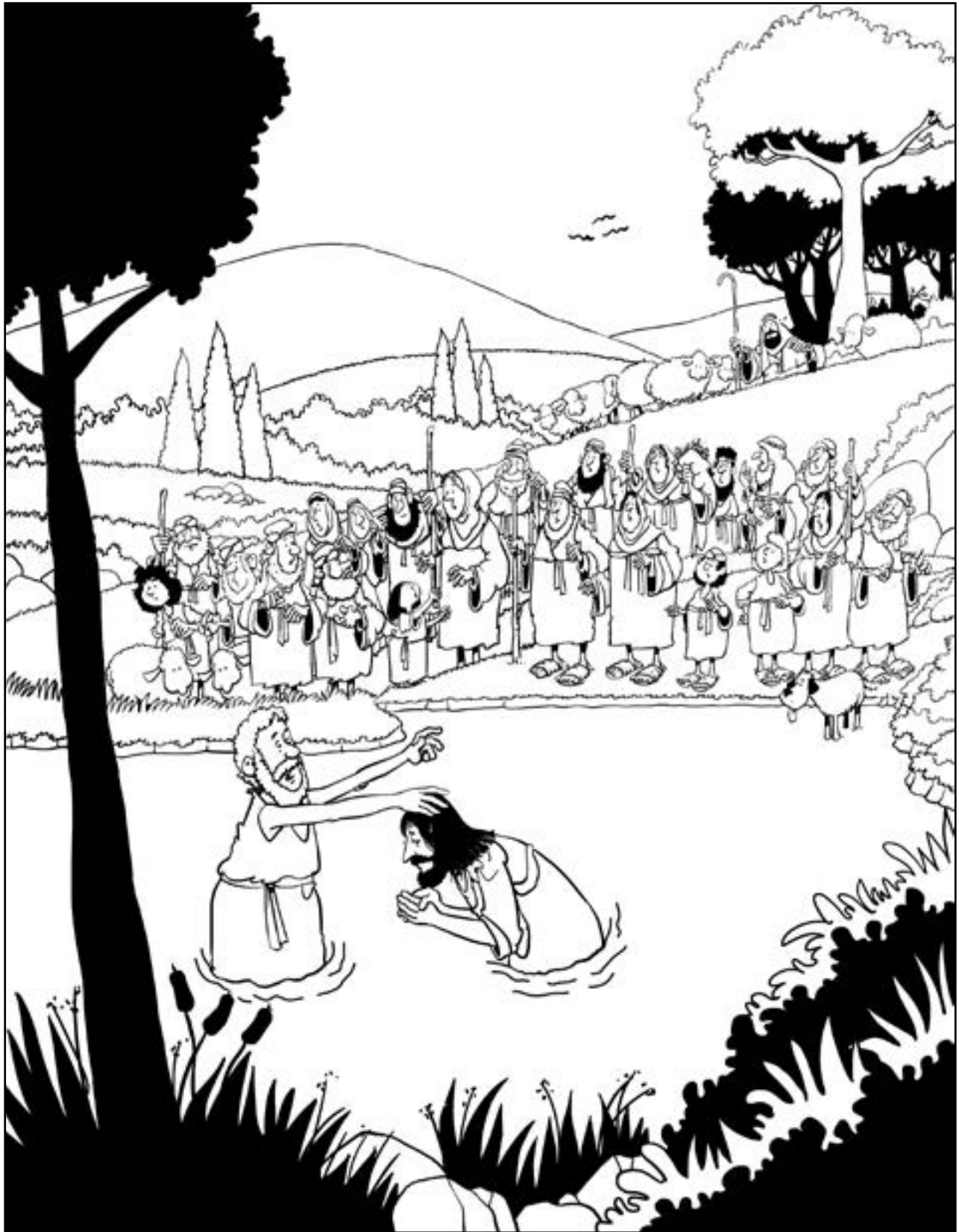
John baptizes Jesus. God is pleased.