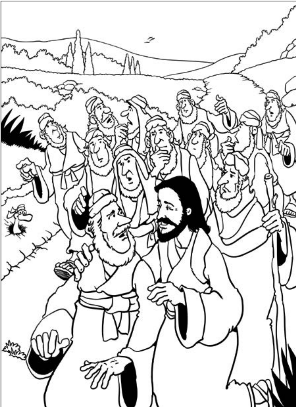
Peter declares that Jesus is the Messiah!