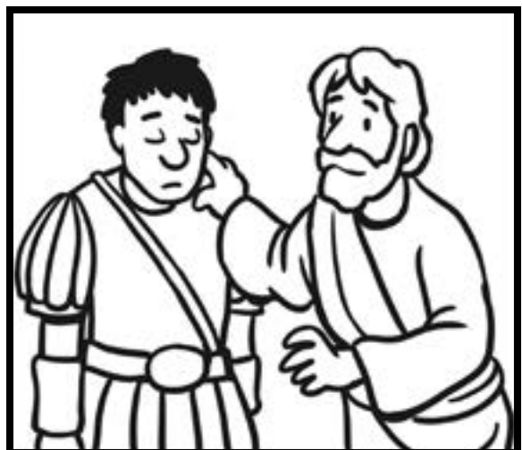
Jesus says he will come to the centurion's house.