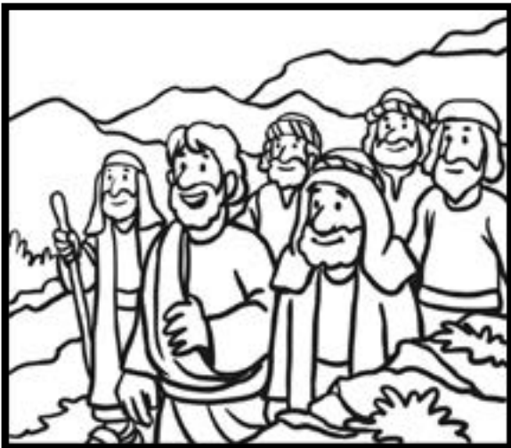
Jesus and the disciples come down from the mountainside.