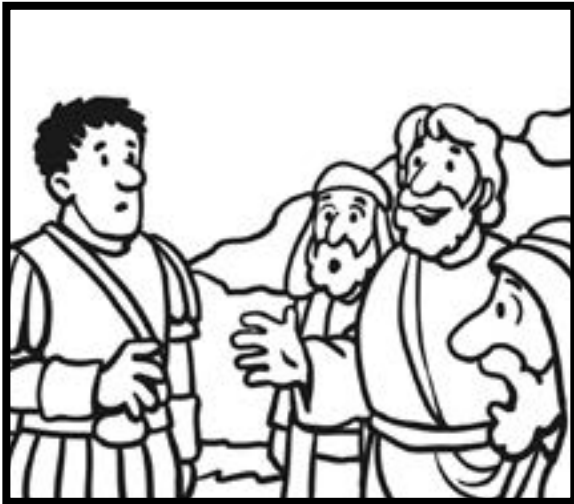
A centurion meets Jesus and the disciples.