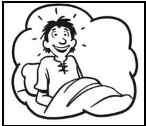
Jesus says that the centurion's servant has been healed.