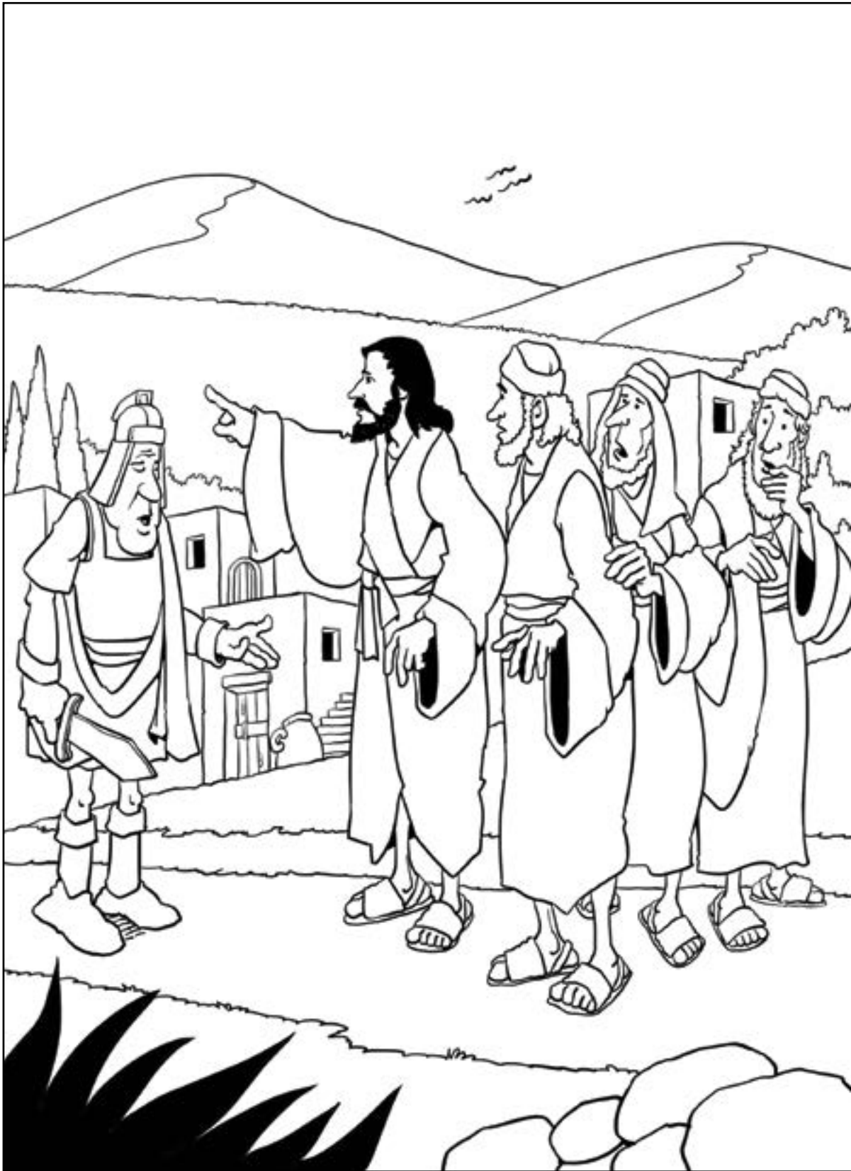
Jesus is amazed at the centurion's faith.