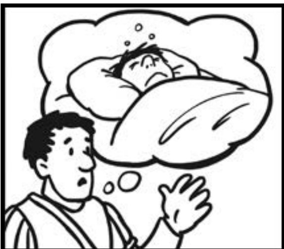
The centurion tells Jesus about his sick servant.