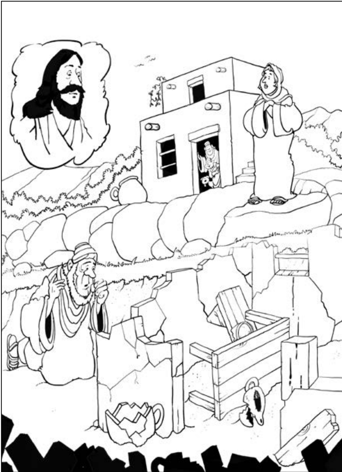
Jesus tells a story about two houses.