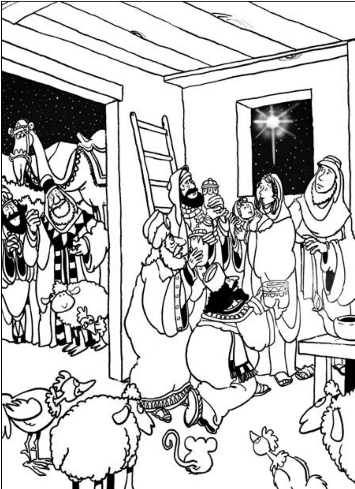
The wise men give gifts to the baby Jesus.