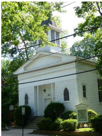
Witherspoon Street Presbyterian Church, Princeton, NJ, founded 1840.

Sunday, October 8, 1:30-3:30 PM, Sanctuary Reception following, Assembly Room