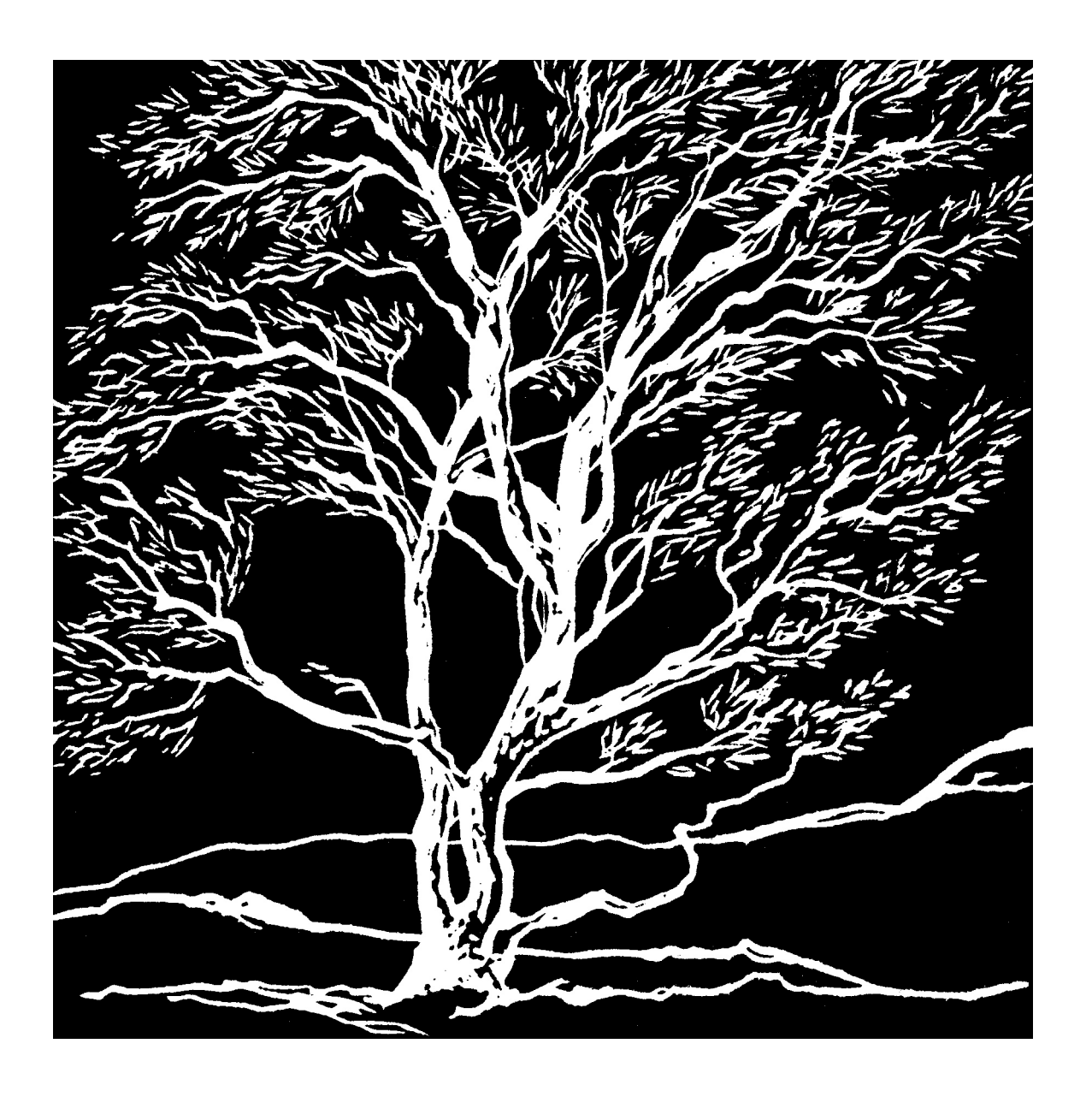
Nassau Presbyterian Church