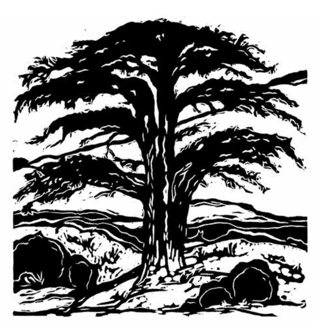
Nassau Presbyterian Church