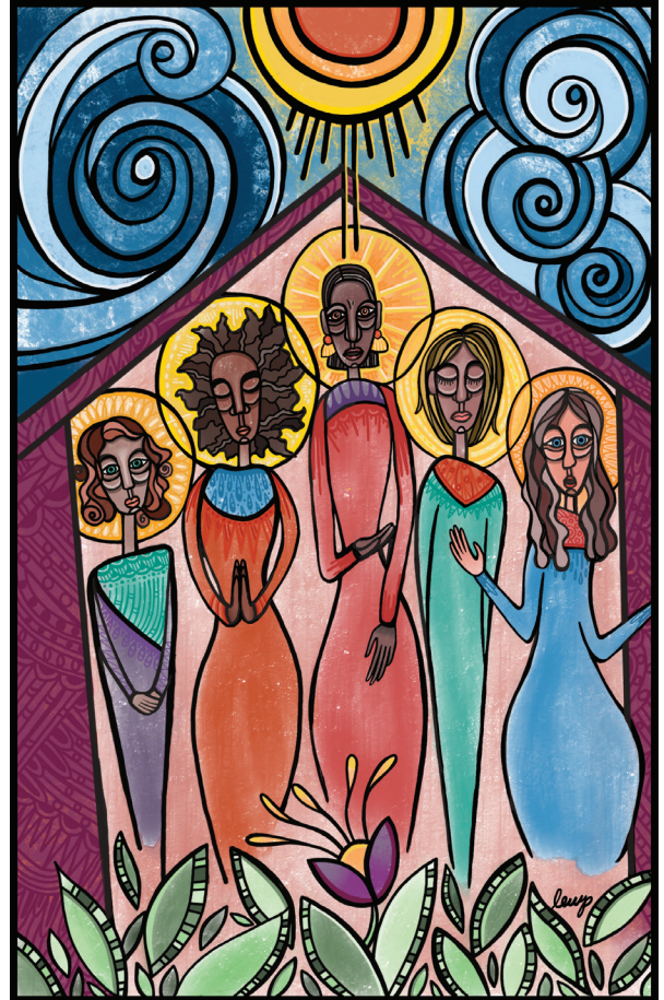
"They Stood (Daughters of Zelophehad)" Lauren Wright Pittman (graphic image, inspired by Numbers 27:1-11) | A Sanctified Art LLC | sanctifiedart.org Used by special permission. All rights reserved.

"Linked-In Learning" helps us explore the same stories from multiple perspectives. In these classes members and friends of the congregation will lead us through the same texts the preachers will take up in worship and small groups will have engaged the week prior. Let's learn together!